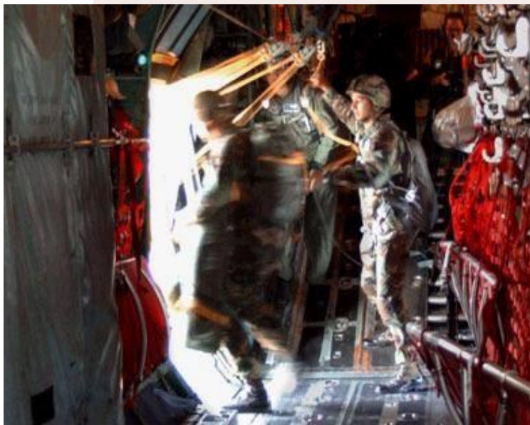
Army paratroopers exit from an Air Force C-130 airplane during a mass tactical airborne exercise in Grafenwoehr, Germany. The Soldiers are assigned to the 173rd Airborne Brigade, based in Vicenza, Italy.