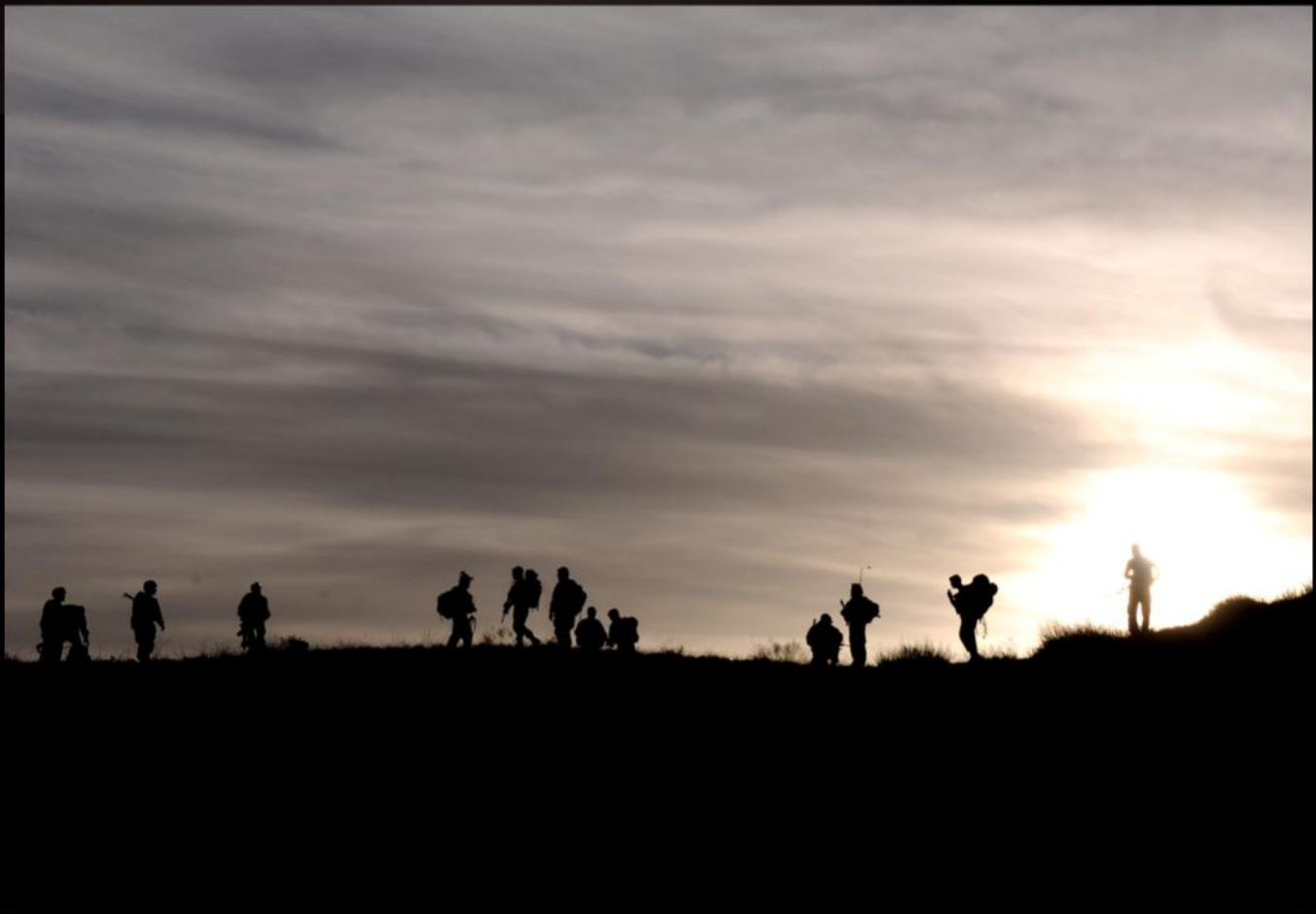
Soldiers from Troop C 1st Squadron 91st Cavalry Regiment patrol a ridgeline near Shaykhan, Kherwar district. Page 8.

ANA, ANP FIND WEAPONS. AIR ASSAULT TO KHERWAR PAGE 12