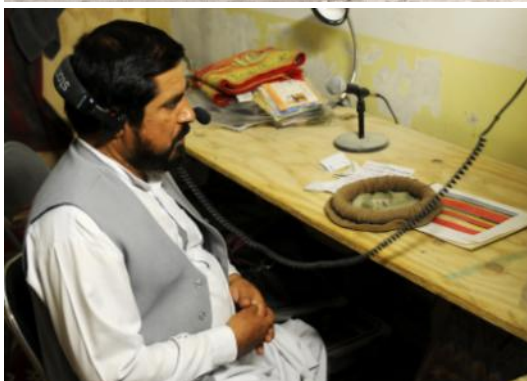
Shuja –u- din Shuja, deputy governor for Afghanistan's Logar province, gives a message on the radio at Combat Outpost Kherwar, May 29. The radio message mirrored his comments to village elders at an earlier shura, asking for help to end fighting and bring development to Kherwar.

Reconstruction Team, respectively. Zrno, following the same lines as Hamayoon and Din Shuja, expressed his concern for the district and asked for help to make Kherwar a suitable destination for development.