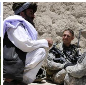
Soldiers from Troop C, 1st Squadron, 91st Cavalry Regiment, 173rd Airborne Brigade Combat Team, patrol Kherwar district in Afghanistan’s Logar province, May 27. Though patrols are becoming increasingly dangerous, the Soldiers of Troop C continue their daily patrols to keep their momentum bringing increased security, development and government presence in Kherwar.

“They come to the DC and they can see the improvements, so it puts a visible face on development for the people,” he continued. “I’m hoping that that’s going to make them want to go back and take responsibility for security in their villages so they also can get those projects.”